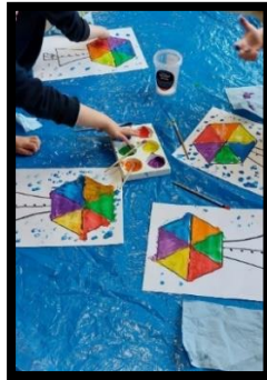
Junior Infants in Room 4 – Colour mixing experiment

We celebrated Science week in early November. Pupils enjoyed participating in a range of experiments throughout the school. Many pupils brought in their own Science experiments from home to share with their class.