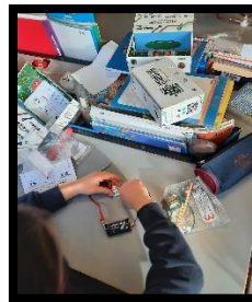
Fifth Class –The House of Circuits