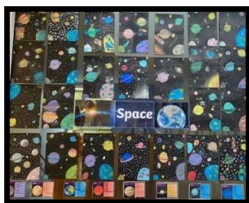
Room 14 – Our Solar System creations