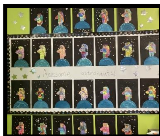
Room 12 – Our Awesome “Future” Astronauts

Many classes explored Space and Astronauts and created beautiful Art work.